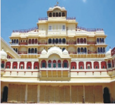
The City Palace

City Palace : In the heart of the old city is the royal residence built in a blend of Rajasthan and Mughal Styles.